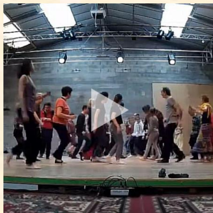
Asymmetric Rhythms, Asymmetric Dances